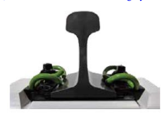
2,E-Clip Fastening System