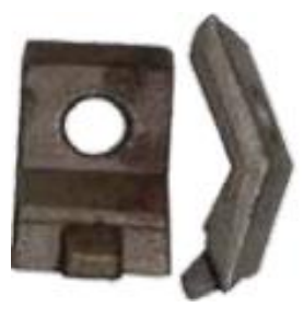
K type rail Clamp