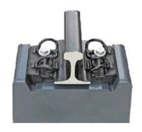
7, High Speed WJ-7 Rail Fastening System