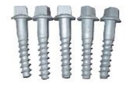
Square head Screw spike