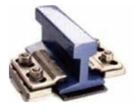
Weldable rail clamps