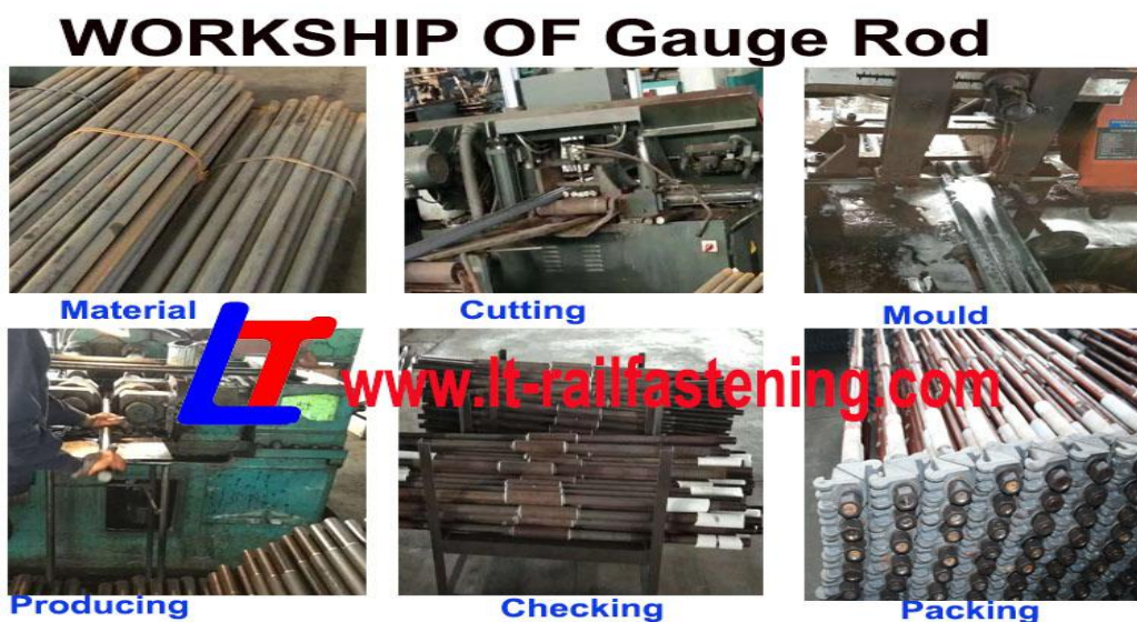
Linzhou Public Service Railway Equipment