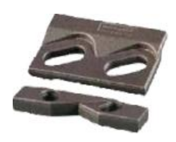
Crane Clamp 22/130 AN/BN