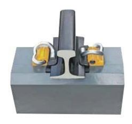
9,Type V Rail Fastening System