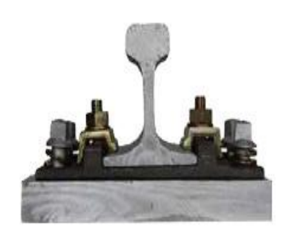
4, Spring Blade Fastening