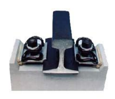
11, Clip II Clip I Rail Fastening System