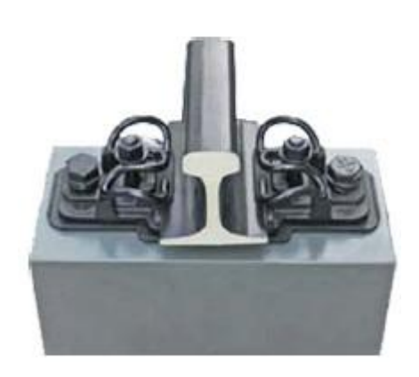
7, High Speed WJ-7 Rail Fastening System